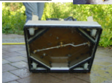
A rotation arm with 2 nozzles close to the surface effects the intensive cleaning