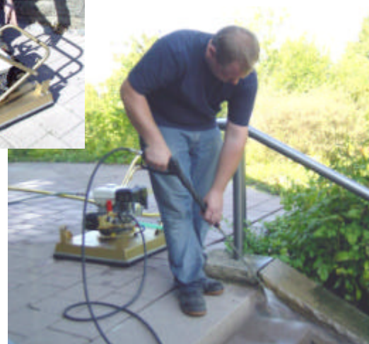
With an optionally available spray lance, adjoining objects and areas can be cleaned as well