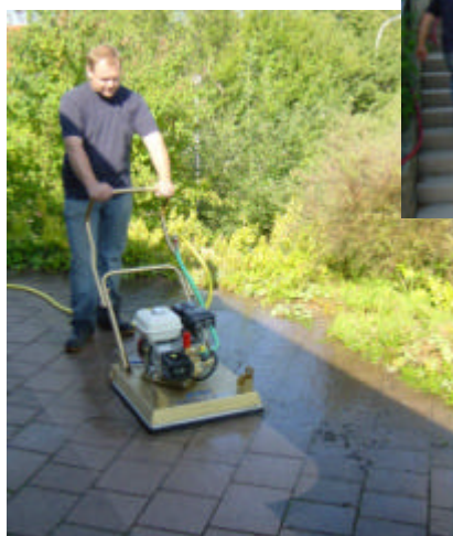
Easy-Clean EC 60 is cleaning surfaces and joints at a time, the jet of water is held under a protection cover