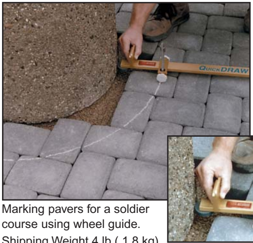
Marking pavers for a soldier course using wheel guide. Shipping Weight 4 lb ( 1.8 kg)