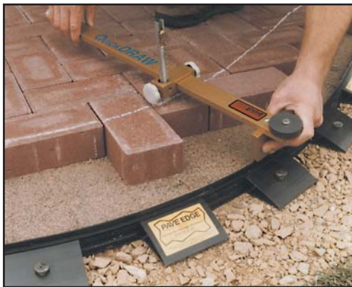
Marking pavers for a soldier course using a PAVE EDGE guide.